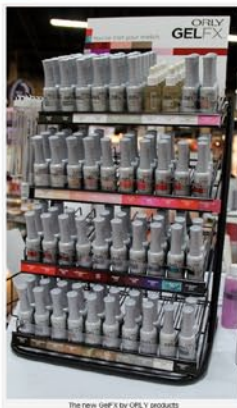
The new GelFX by ORLY products.

Details: ORLY International is available in 66 countries worldwide. For more information on their products visit their website .