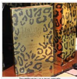
The palette per se, for a Jersey new babe.

Details: The Halle Berry Leopard Couture palette is available for US $25, and will be available in the US very soon. In Australia, a limited selection of NYX Cosmetics products are available from Cyan Cosmetics , but there is no word yet on whether this palette will be available.