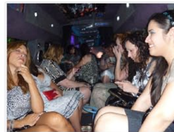
A line full of beauty bloggers.

Details: Jesse's Girl Cosmetics is available online (International Shipping available) and from Rite Aid stores in the US.