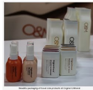
Beautiful packaging of travel size products at Original & Mineral.

Details: Original & Mineral is currently available in Australia and New Zealand only. To find your nearest stockist, or to stay abreast of when this brand will be available in your country, check out the website .